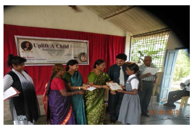
Award Recipient in Kesanapalle, AP, India