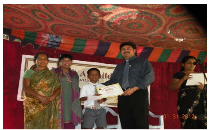
Our first visit to Chittoor